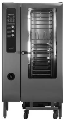
Multimax B 20-11